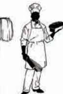
Food Service Providers